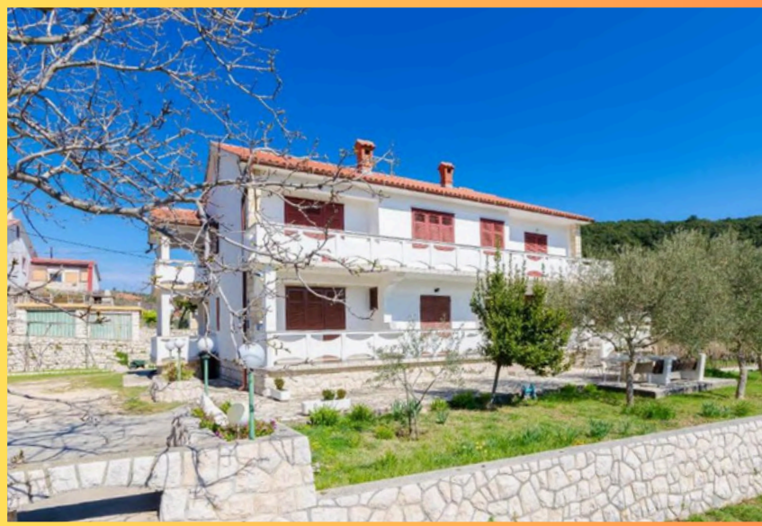
AUTHENTIC LOCAL STAY